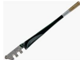
Straight End Hard Glass Carbide Wheel Glass Cutter 5" long